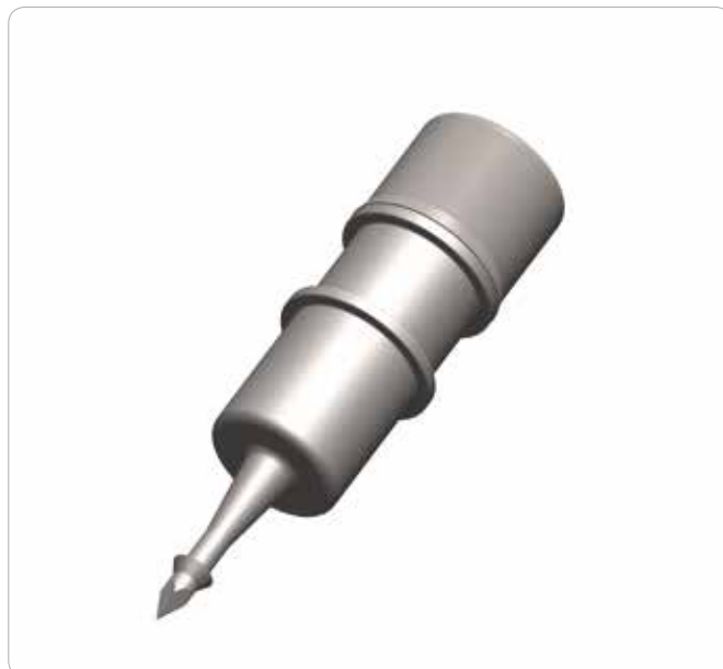
iDose, a unique drug delivery device

The treatment is straightforward and designed to restore natural outflow, while preserving the trabecular meshwork. It may allow for glaucoma medications to be reduced or eliminated at the discretion of eyecare professionals. With a safety profile similar to cataract surgery alone, it provides a very favourable benefit-to-risk ratio.