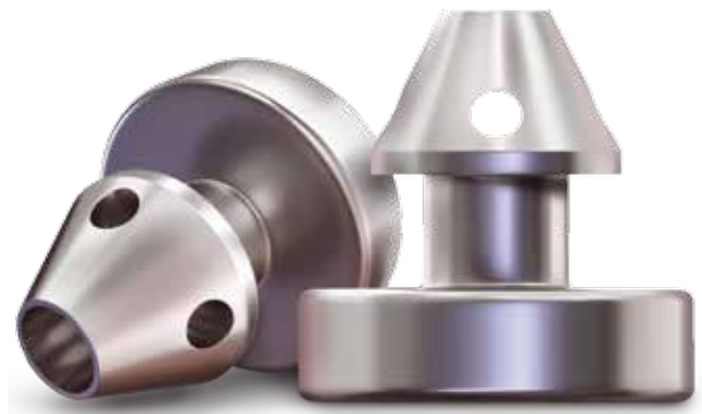
iStent inject W