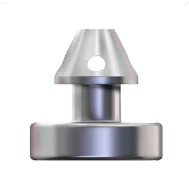
The wider flange on iStent inject W allows for advanced visualisation during implantation